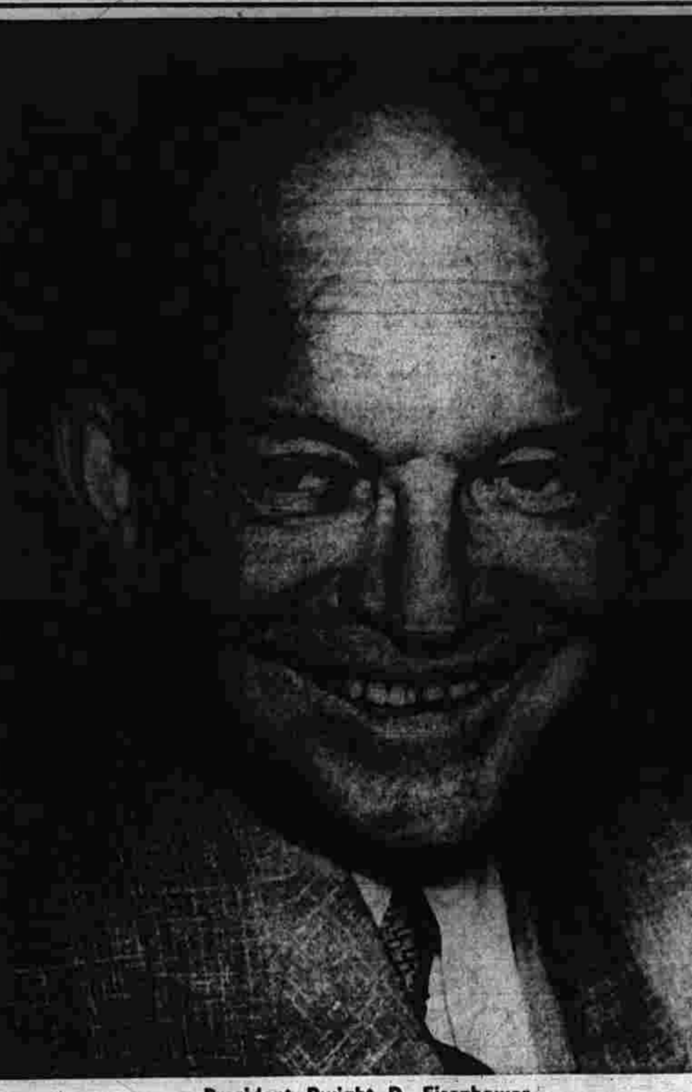
President Dwight D. Eisenhower